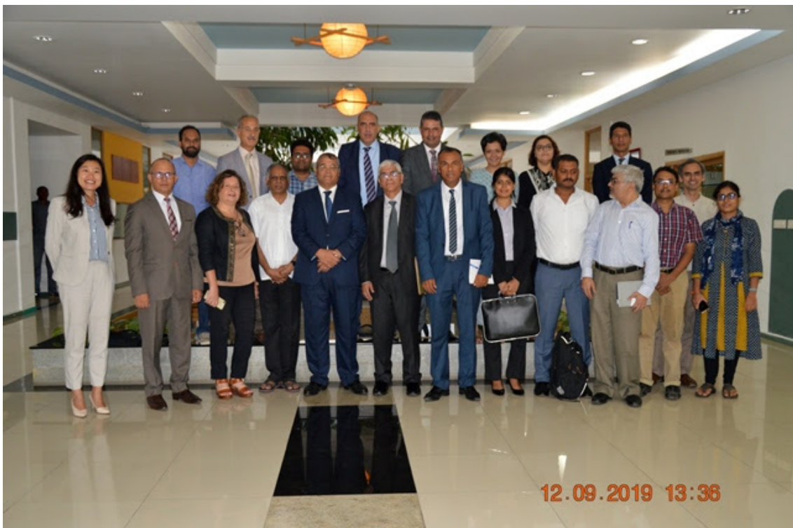
September 12: Delegation from Tunisia