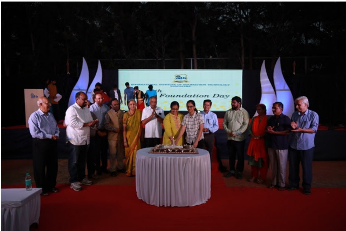
Celebration of 20th Foundation day of IIITB.

Eventually, it's the truth that surprises you so, reflect and be true to yourself.