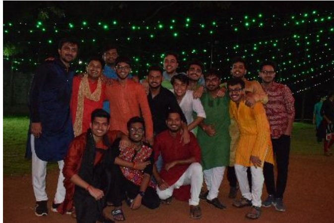
IIITB students in Garba night organised in the campus.