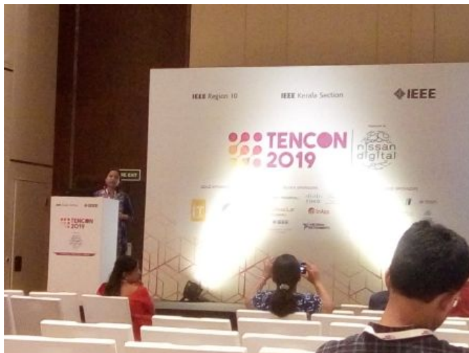
Debanjali Bhattacharya (PH2015018), presented two papers (oral) at TENCON 2019 - IEEE Region 10 International Conference held at Kochi, Kerala, during October 17 to October 20, 2019.