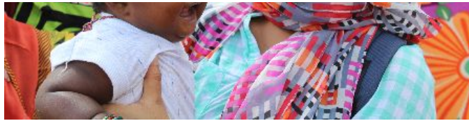
Aikyam (club at IIITB) celebrated Deepavali in slum near Sulikunte (about 15 km from the campus)