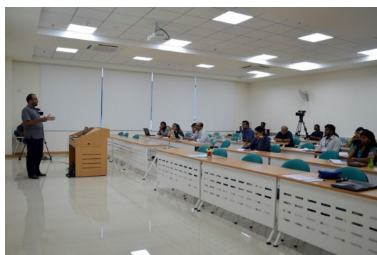
The Faculty Strategy Brain-storming Session was held on December 14.

IIIT Bangalore and CUTS International partnered together to organize the IIIT-B CUTS Workshop on Broadband Labels , to generate awareness and sensitize multiple stakeholders such as policy makers, industry and consumers to advocate for broadband labels that are readable in a simple and standard format (similar to nutrition labels on food packs) and at the same time to empower consumers with information in making informed decisions on usage and purchase of broadband data plans. The workshop was co-chaired by Prof. V. Sridhar, IIIT Bangalore and Mr. Rahul Singh, CUTS International, and was organised at IIIT Bangalore on December 15. The event was attended by officials of the Telecom Regulatory Authority of India (TRAI) and industry experts.