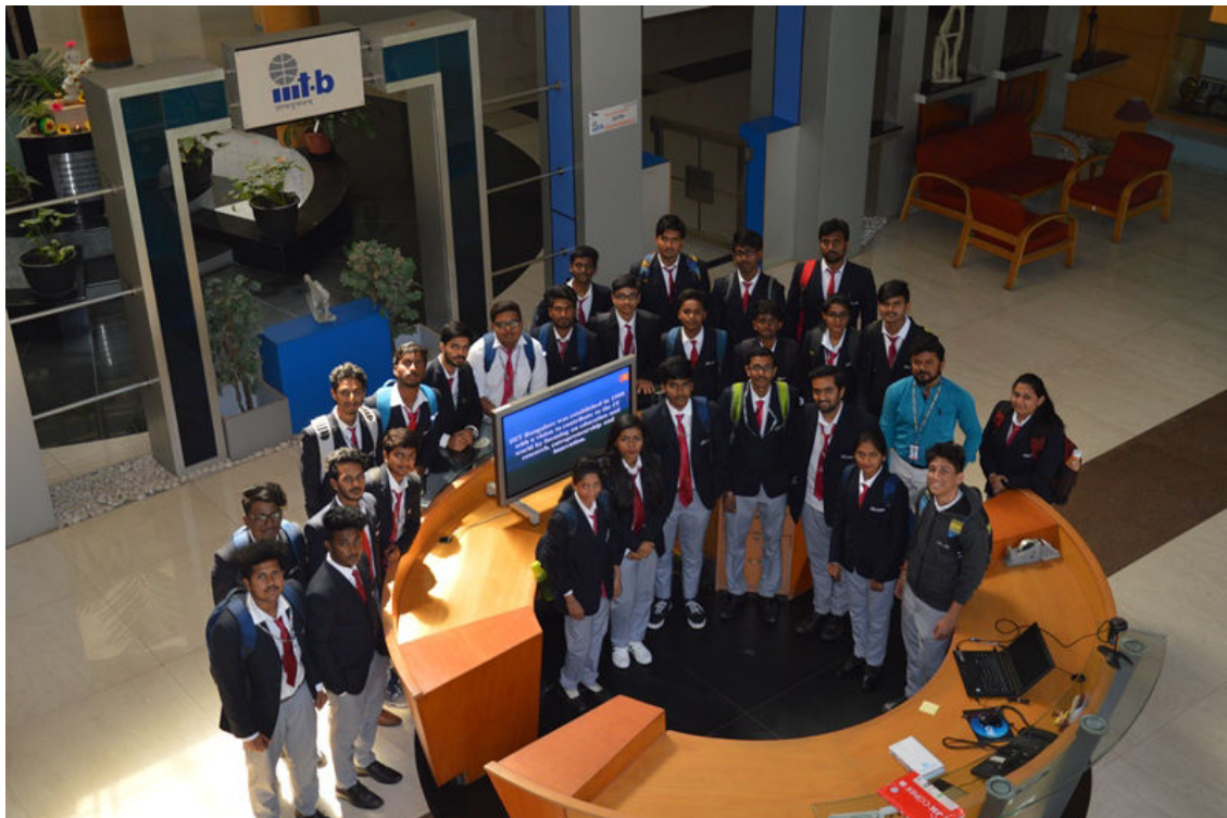
January 31: Visit of students of Acharya's Bangalore B-School